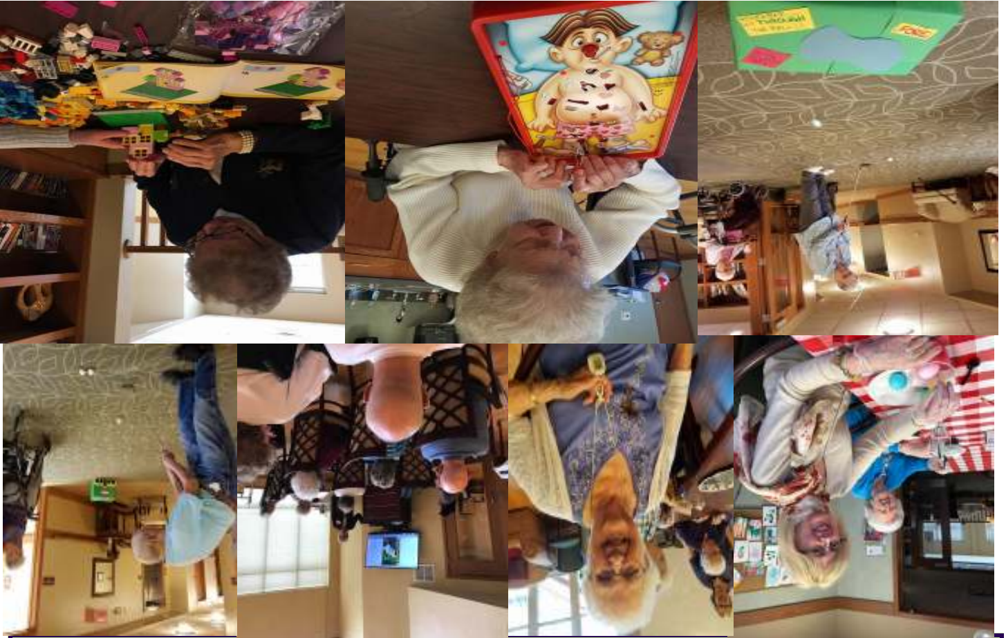
Good Times that have happened at The Heights!

201 North Fourth Street Evansville, Wisconsin 53536